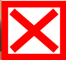
Figure 4 – This image demonstrates inappropriate wear of the procedure mask. Procedure mask should not be pulled under mouth