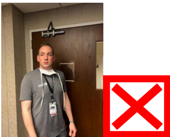
Figure 7 - This image demonstrates inappropriate wear of the surgical mask. Surgical mask should not hang from lower ties