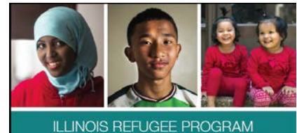
ILLINOIS REFUGEE PROGRAM